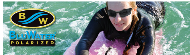
D-SIGN BW OUTDOOR 3