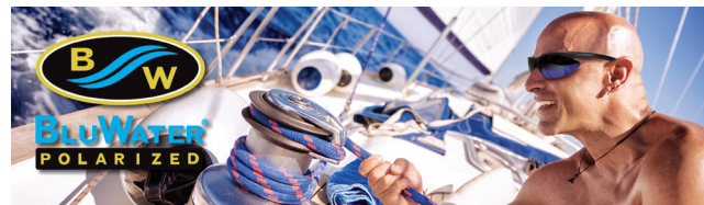
D-SIGN BW OUTDOOR 2