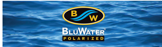
D-SIGN BW GENERIC